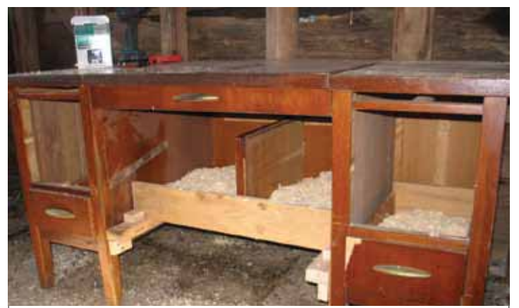
Old office furniture can make comfortable chicken nest.

Sanitation and cleanliness are because they can be absorbed guaranteed prevention of