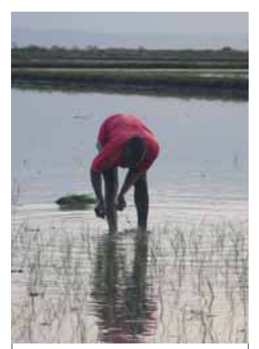
A farmer planting rice in Mwea. Rice paddies are breeding grounds for bilharzia.

These means that the fewer the people affected by this worm, the lesser the eggs that reach the ponds, lakes and other standing freshwater basins, where they affect children and adults having contact with the water. To prevent the parasite from developing in the human body, the drug Praziquantel helps. It paralyses and therefore kills