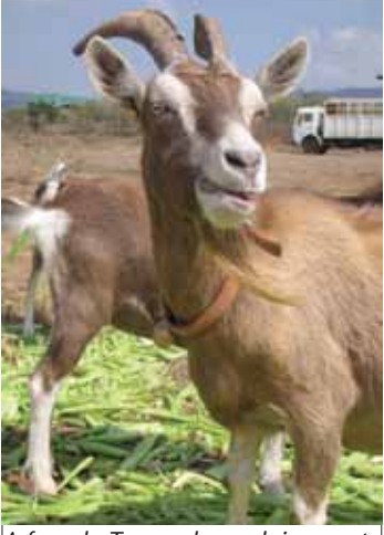
A female Toggenburg dairy goat. pedigree European bucks like

DGAK is encouraging smallscale farmers to go into goat's milk venture. This boom is supported by the introduction of more productive goats, using