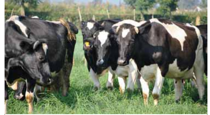
It pays to feed and tend your dairy cows.

The genetics of these breeds enable them to produce high quantities of milk. However, they equally require a specific quantity of nutrients to do this. Farmers know well that on very poor soils or with inadequate water supply, even the best high-yielding hybrid maize variety will fail. The same is true for superior livestock breeds: If fed and managed inadequately, you will just see another emaciated creature in your cowshed.