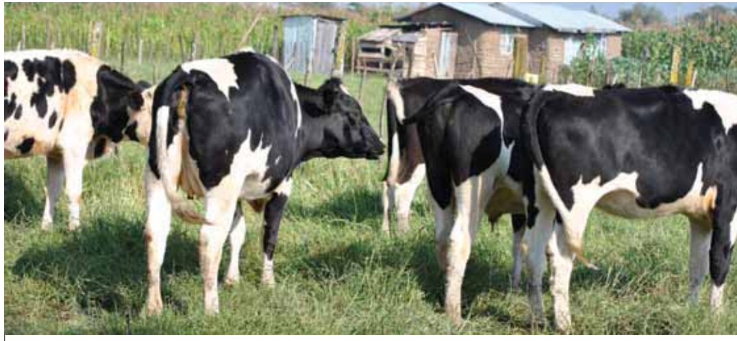
Farmers should never mix bulls and cows except at the time of serving.

Stress free: Cows should be kept in a clean and stress free