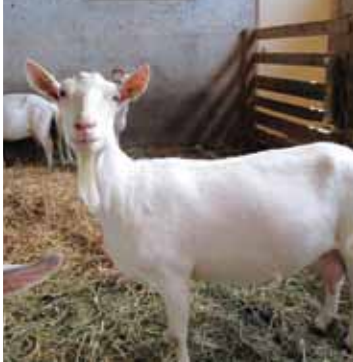
Swiss goats: Toggenburg (above) and Saanen (below).